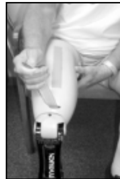
Securing lanyard to socket.