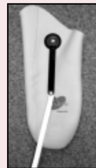
Summit Lock tab attached to liner.

The Summit Lock by Coyote Design is an innovative new lock suspension method for patients wearing roll-on suspension liners, which offers particular promise for transfemoral and through-knee amputees whose long residual