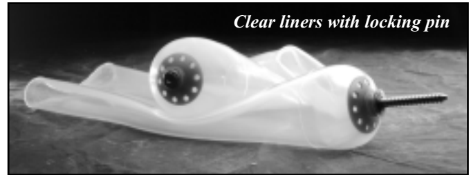
Clear liners with locking pin

While polymer foam inserts made of such products as Pelite, Plastazote, Nickleplast and Poron have become a common socket interface, viscoelastic (gel) products have surpassed them