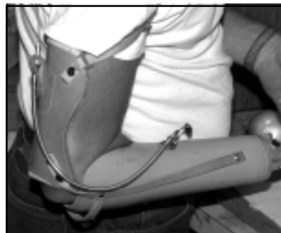
Transradial body-powered prosthesis.

Transhumeral —The addition of an elbow joint adds to the complexity of the prosthesis. The most common approach is to incorporate a second, independent control cable to lock and unlock the elbow unit. In such an arrangement, movement of the primary cable while the elbow is unlocked generates elbow flexion/extension. Once the lock is actuated by secondary cable action, further primary cable travel is transferred to actuate the terminal device. In special designs, the lock may be actuated by movement of residual limb muscles.