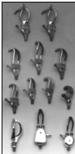
A wide selection of hook sizes and shapes is available.

The Hosmer Driving Ring , for example, attaches easily to steering wheels of automobiles, boats and aircraft, providing a sure connection seldom achieved with a standard hook or hand.