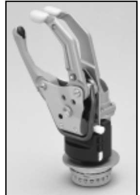
Otto Bock SensorHand (see page 4)

Many upper-limb prostheses are suspended by a combination of intimate socket fit and a strategically positioned upper-body harness, (Continued on page 2)