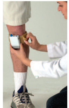
WalkAide® FES system for addressing foot drop

Articles on pages 2 and 3 discuss three products producing excellent results in the management of foot drop and a unique approach to securely surface electrodes on almost any part of the body. We welcome you inquiries and referrals.